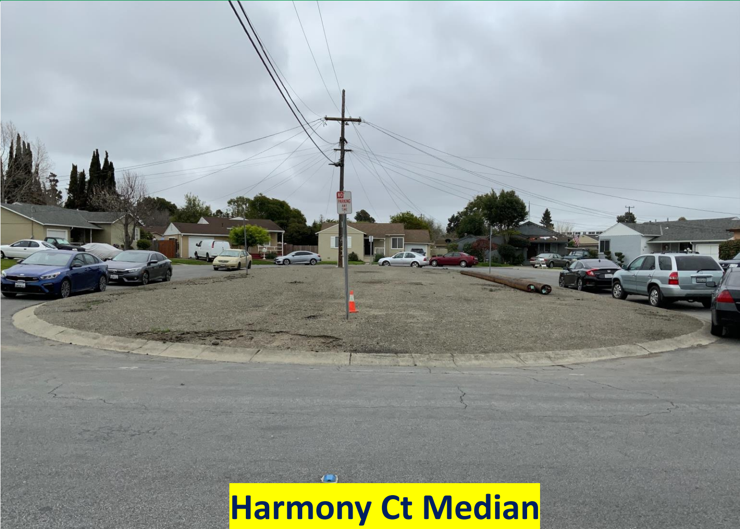
Harmony Ct Median